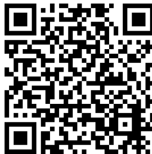
School Selection Website