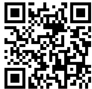
Philly High School Fair